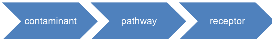
Figure 1: Contaminant linkage

The term “contaminant linkage” means the relationship between a contaminant, a pathway and a receptor. All three elements of a contaminant linkage must exist in relation to particular land before the land can be considered potentially to be contaminated land under Part 2A, including evidence of the actual presence of contaminants.