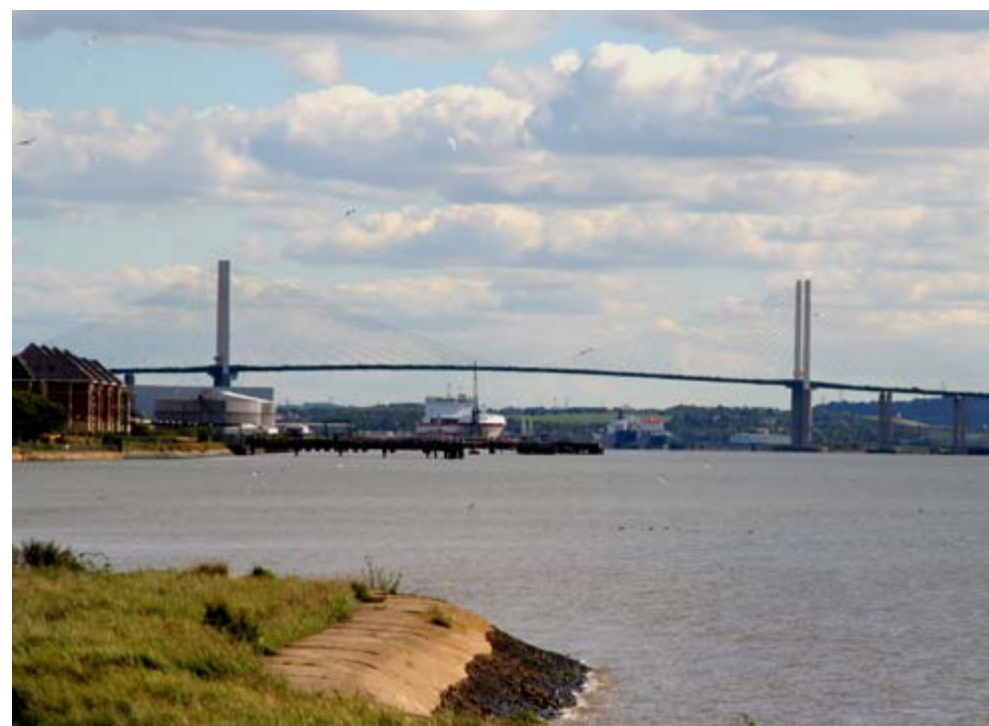
The Queen Elizabeth II Bridge joining the M25 as it crosses the River Thames at Dartford, seen from Rainham Marshes.

Charles Dickens used Cooling Marshes on the North Kent coast as the setting for the beginning of Great Expectations and his evocative description of the marshes, written 150 years ago, still holds true today: "... the dark flat wilderness beyond the churchyard, intersected with dykes and mounds and gates, with scattered cattle feeding on it, was the marshes; and that the low leaden line beyond, was the river; and that the distant savage lair from which the wind was rushing, was the sea..."