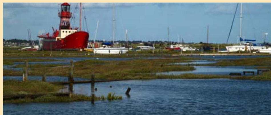
Tollesbury saltings in the Blackwater Estuary in Kent.