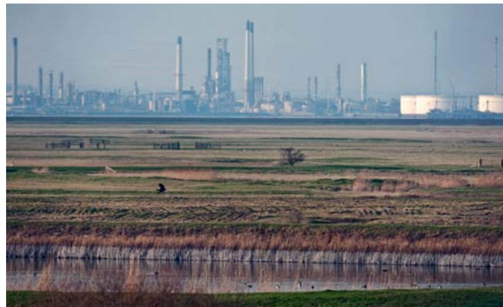
Industry is highly visible in the low-lying reclaimed grazing marsh on the Isle of Grain in Kent.

The coastal landscape mainly consists of a maze of winding, shallow creeks, drowned estuaries, mudflats and broad tracts of tidal salt marsh with sand and shingle beaches along the coast edge. The relatively permanent, branching, meandering creeks which dissect the salt marshes fill and empty with the tide and provide an interesting temporal variation within the marsh landscape. The area holds an extensive tract of important coastal habitat and this is reflected in the vast majority of its coastline and estuaries being