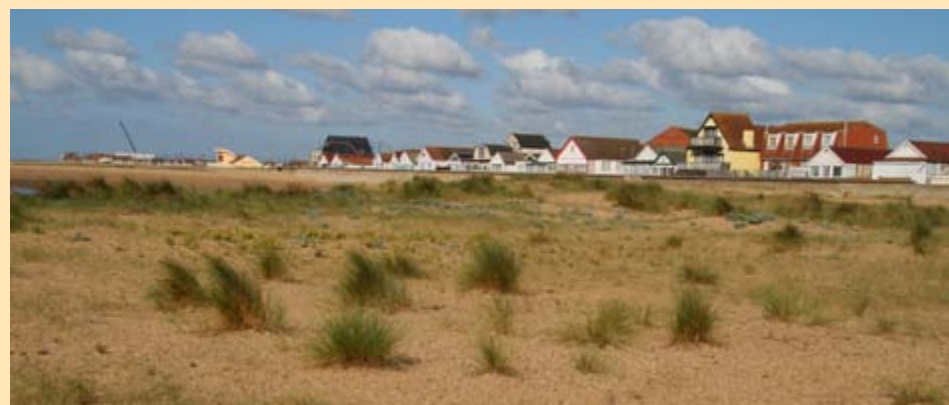
Jaywick holiday plotland development in Essex.