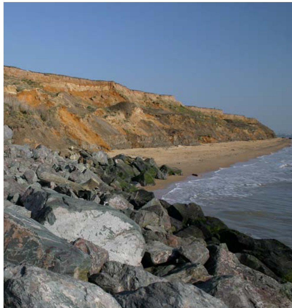
Tertiary sediments at the Naze SSSI in Essex, which contain fossils of international importance.