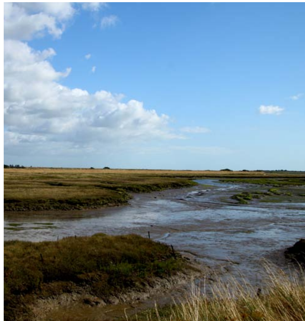
Coastal saltmarsh habitat at Hamford Water in Essex.