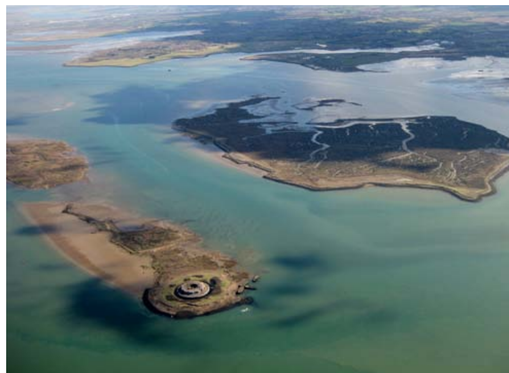
Aerial view of Darnet Fort in the Medway, Kent.

The physical development of the Greater Thames Estuary has been dominated by the relative levels of land and sea. In the 11,500 years since the end of the last glaciation and the onset of the Holocene (our present interglacial) epoch, the sea has risen some 30 m to its present level. The marshes themselves have been created and sustained by material carried by the sea from the north, a natural process of accretion that has added many thousands of hectares to the marshes of Kent and Essex since Anglo-Saxon times.