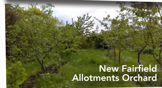
New Fairfield Allotments Orchard