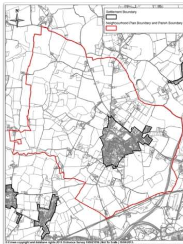
Neighbourhood Plan Area

consultation was held in June 2013. No objections were forthcoming and the plan was confirmed and is shown adjacent: