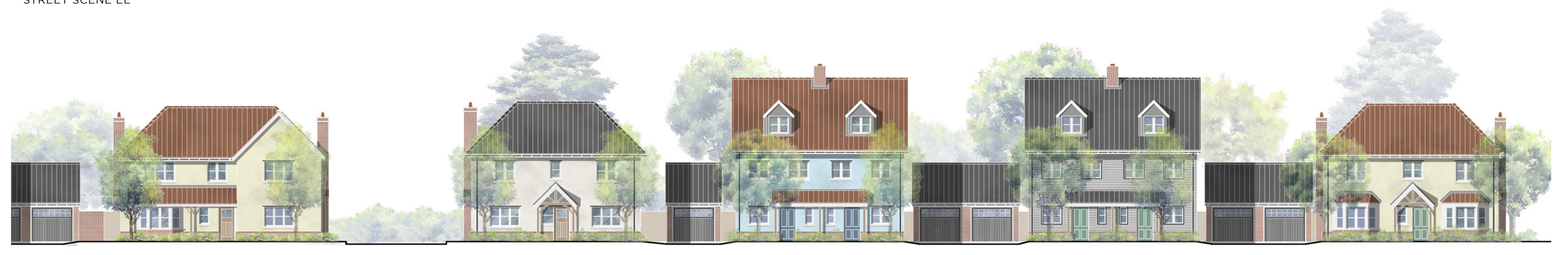
PLOT 10 PLOT 17 PLOT 18 STREET SCENE EE CONTINUED STREET SCENE EE CONTINUED