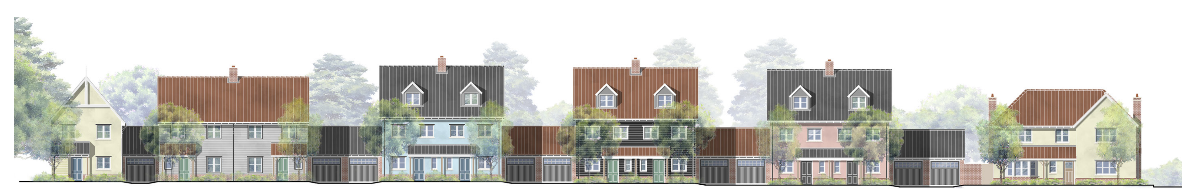
PLOT 01 PLOT 02 PLOT 03 PLOT 04 PLOT 05 PLOT 06 PLOT 07 STREET SCENE EE