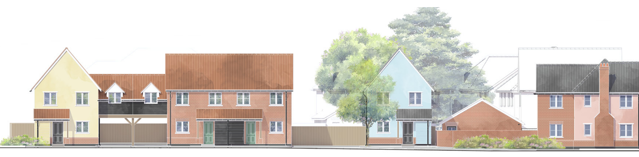
PLOT 26 PLOT 27 PLOT 28 PLOT 29 PLOT 30