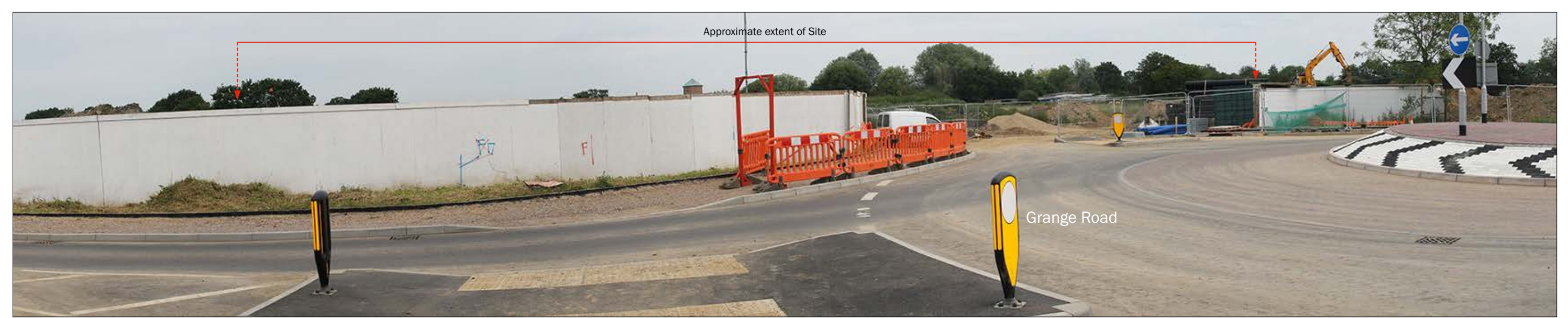
Photo Location 8: View looking north west towards the Site from Grange Road.