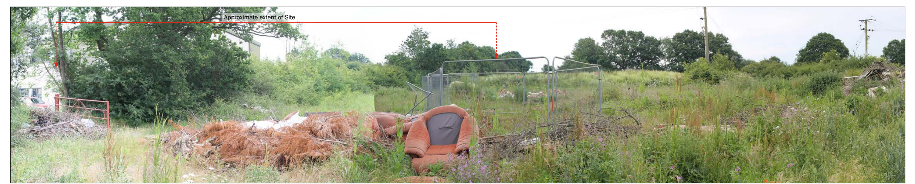
Photo Location 2: View looking east towards the Site from PRoW 150_4.