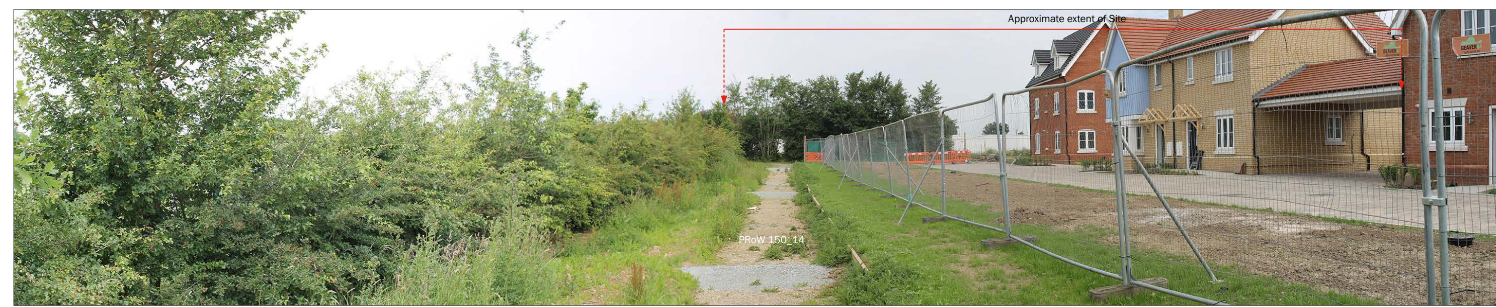
Photo Location 7: View looking north west towards the Site from PRoW 150_14.