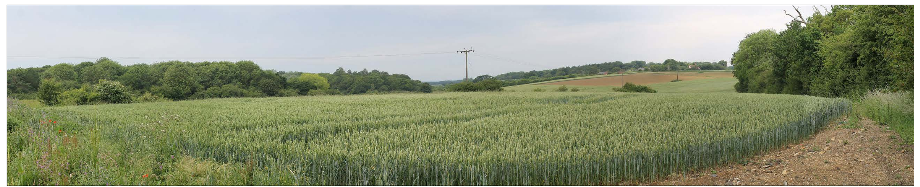
Photo Location 1: View looking west away from the Site from PRoW 150_4.