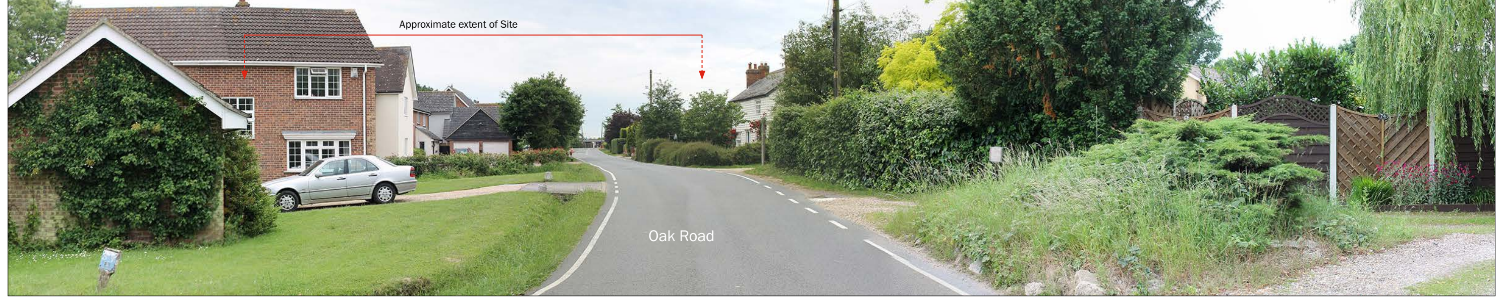
Photo Location 15: View looking west towards the Site from Oak Road.