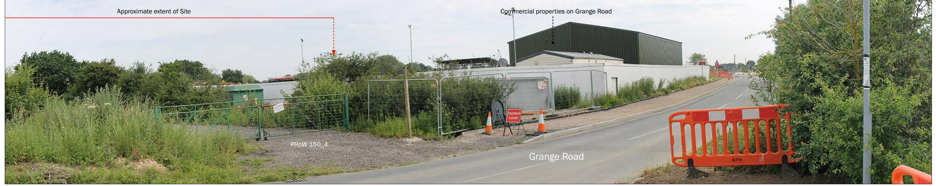
Photo Location 6: View looking north east towards the Site from Grange Road and PRoW 150_4.