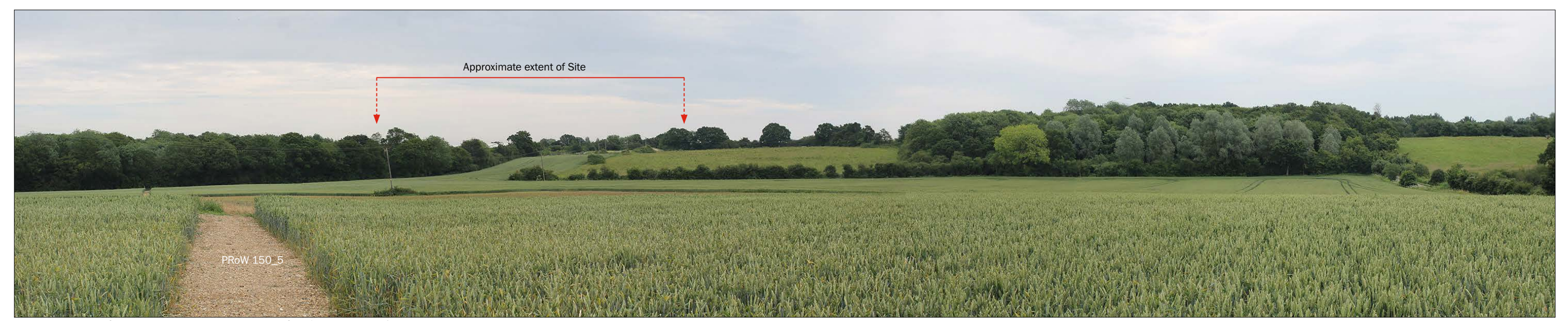
Photo Location 16: View looking east towards the Site from PRoW 150_5.