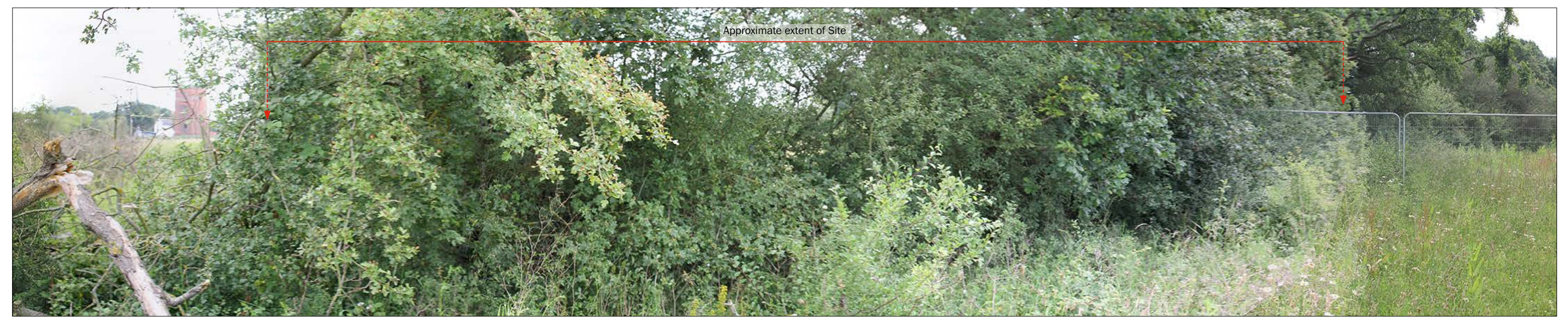
Photo Location 3: View looking north east towards the Site from PRoW 150_4.