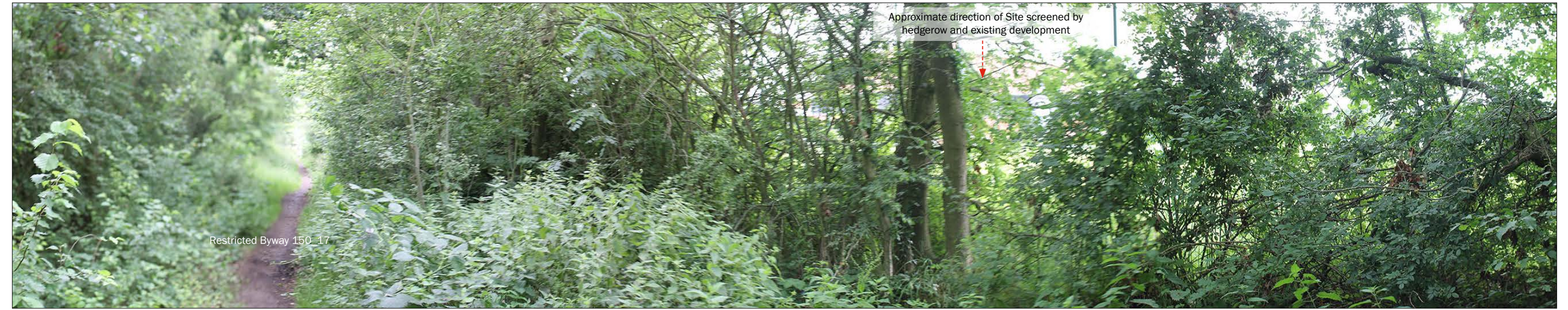
Photo Location 20: View looking north east towards the Site from Restricted Byway 150_17.