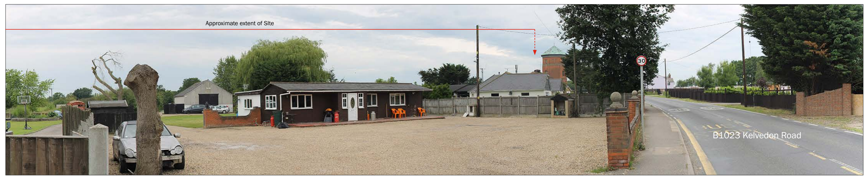
Photo Location 13: View looking west towards the Site from B1023 Kelvedon Road.