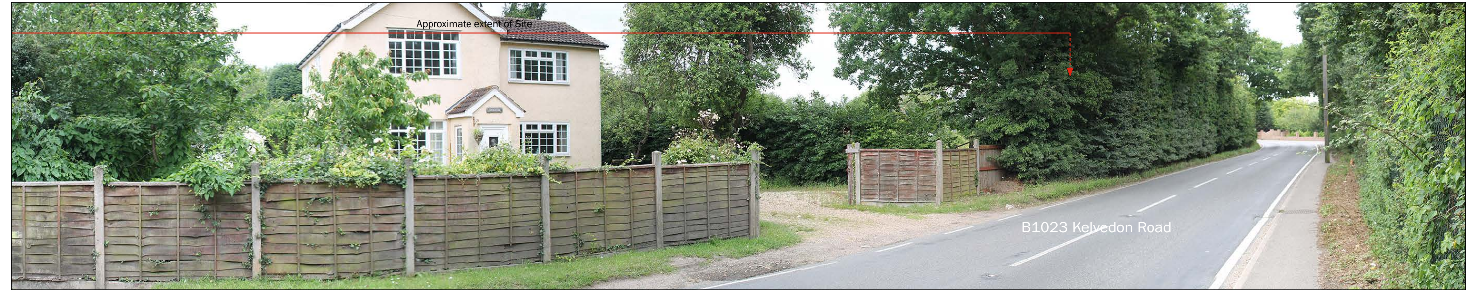
Photo Location 11: View looking west towards the Site from B1023 Kelvedon Road.