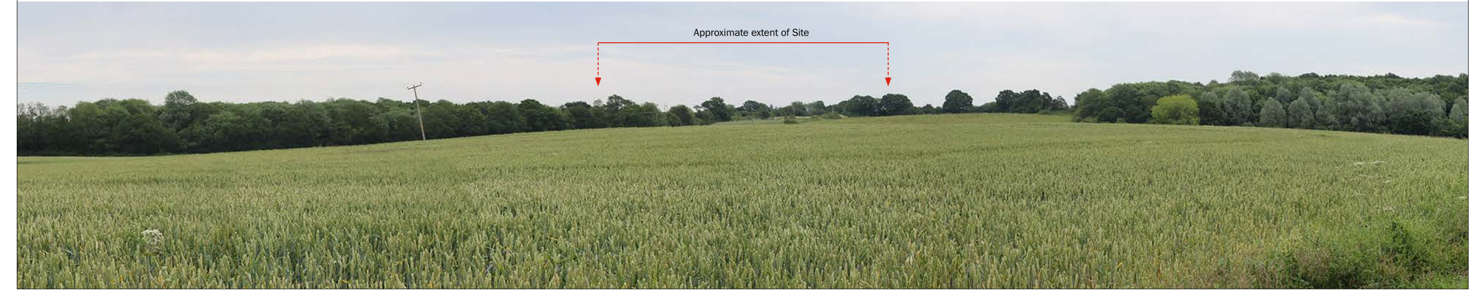
Photo Location 18: View looking east towards the Site from Windmill Hill and PRoW 150_5 junction.