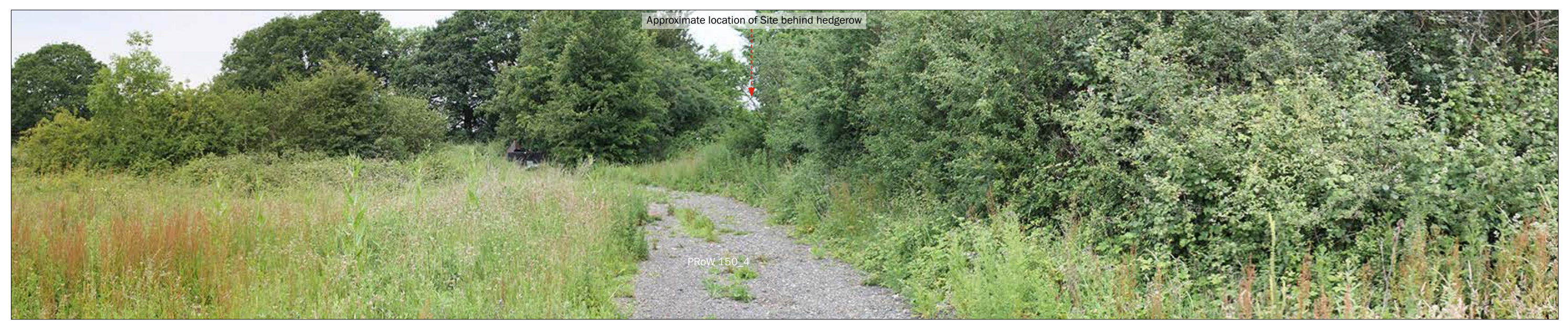
Photo Location 4: View looking north west towards the Site from PRoW 150_4.