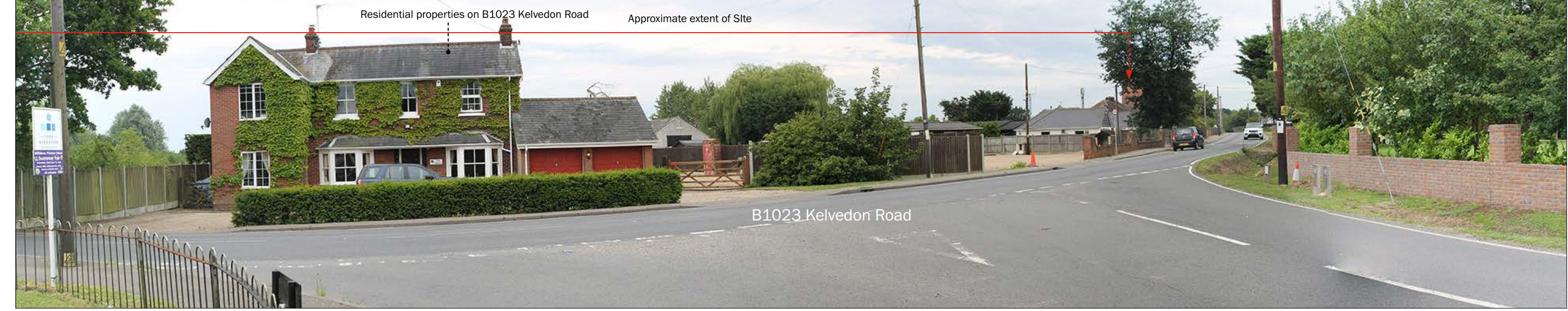
Photo Location 12: View looking south west towards the Site from B1023 Kelvedon Road.