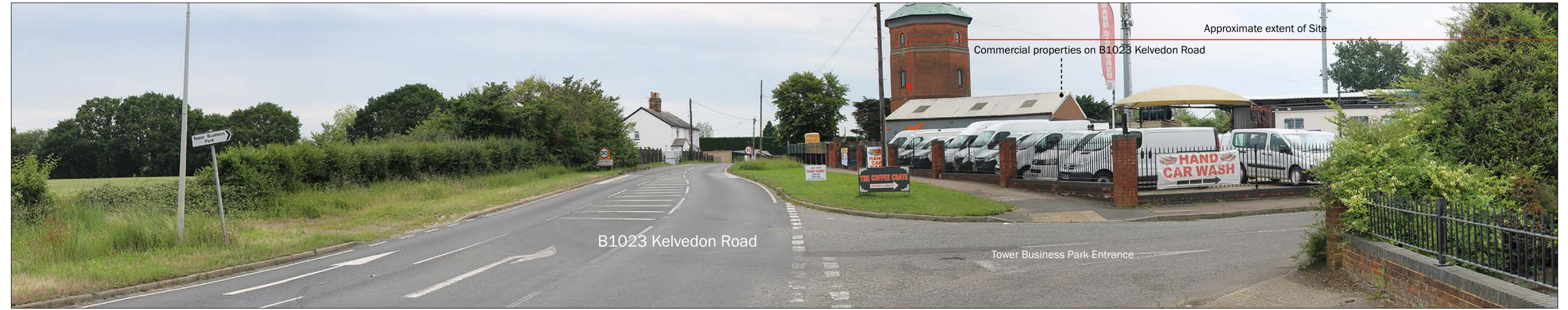
Photo Location 14: View looking south east towards the Site from B1023 Kelvedon Road.