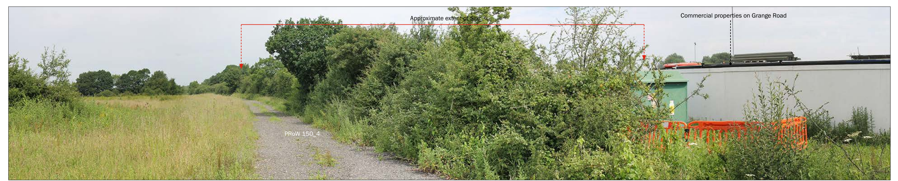
Photo Location 5: View looking north towards the Site from PRoW 150_4.