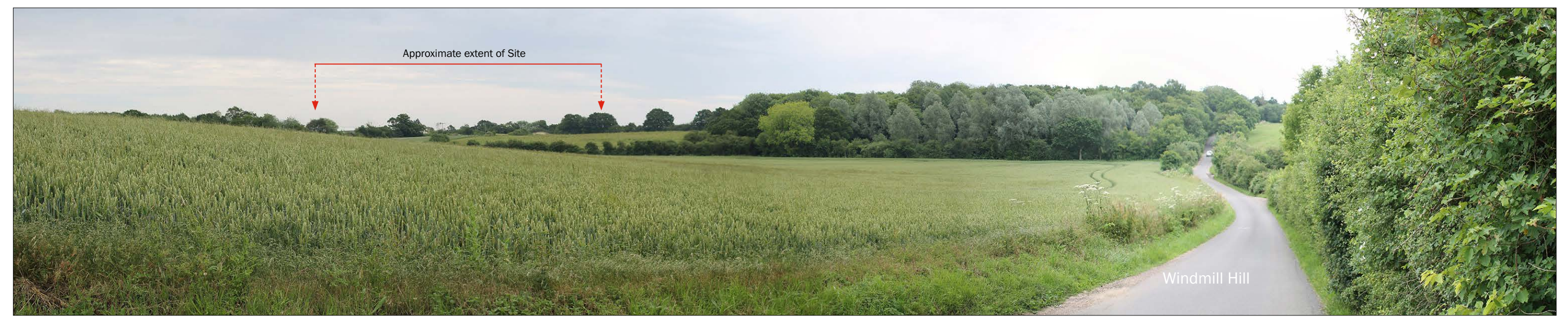
Photo Location 19: View looking east towards the Site from Windmill Hill.