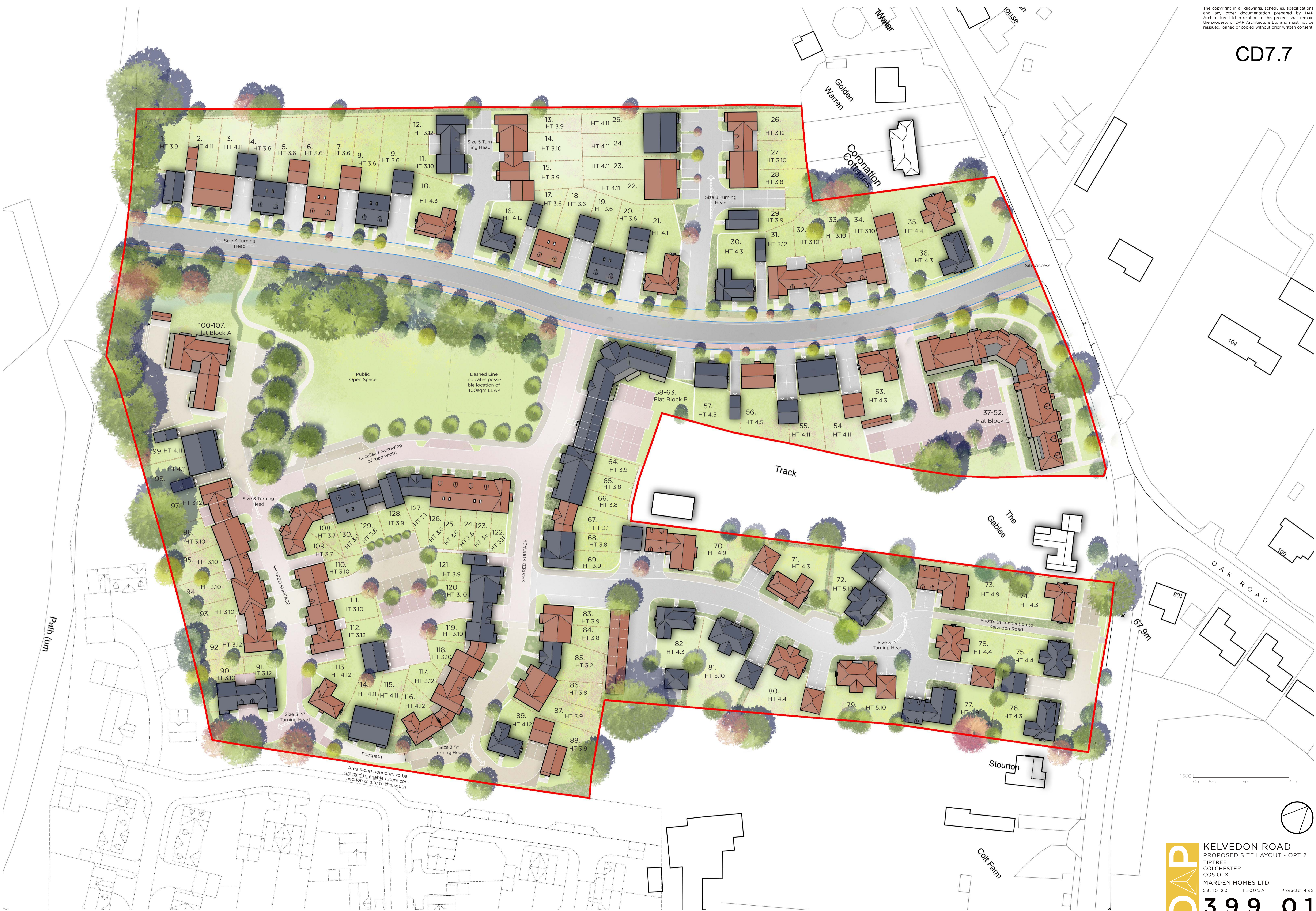
AS PROPOSED LAYOUT PLAN INDICATING 6.75M WIDE ROAD