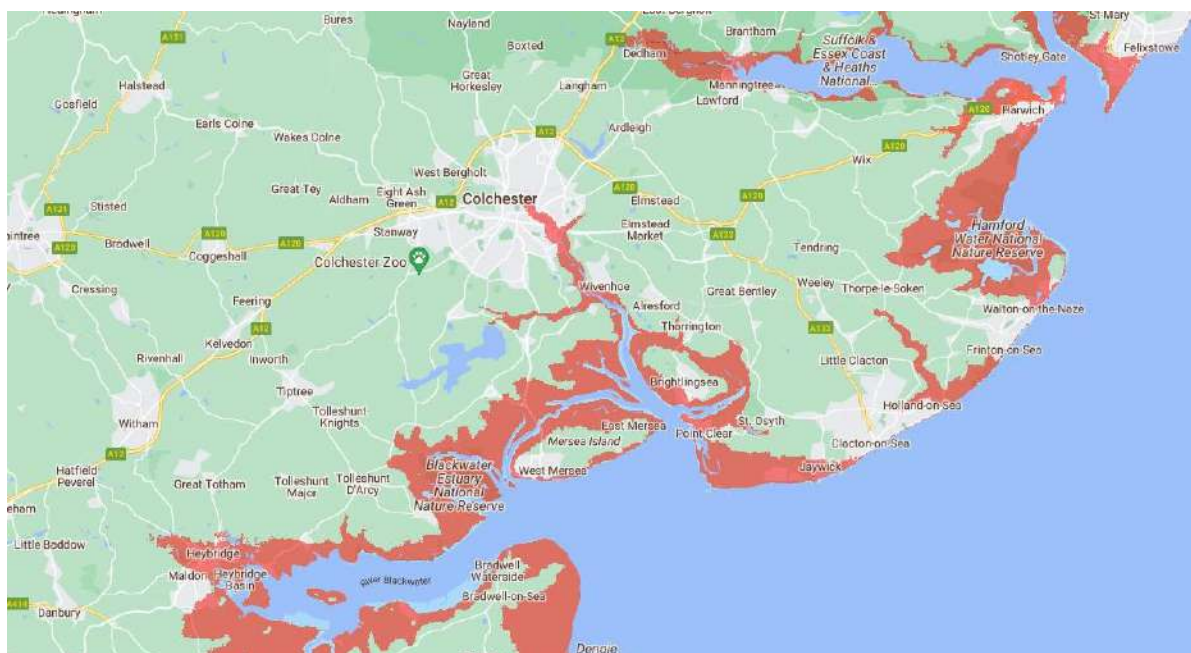
Figure 3: Map showing the land that is projected to be below the annual flood level in 2050. The annual flood level shows areas which statistically flood every year on average. This does not mean they will flood every year and in some years they may flood more than once. 23

In the near term to 2030 using RCP 2.6, average summer rainfall is predicted to reduce by 3.8% whereas average winter rainfall is predicted to increase by around 2%. However, under an RCP 8.5 scenario, summer rainfall could decrease by 43%-50% and winter rainfall increase by 13%-20%.