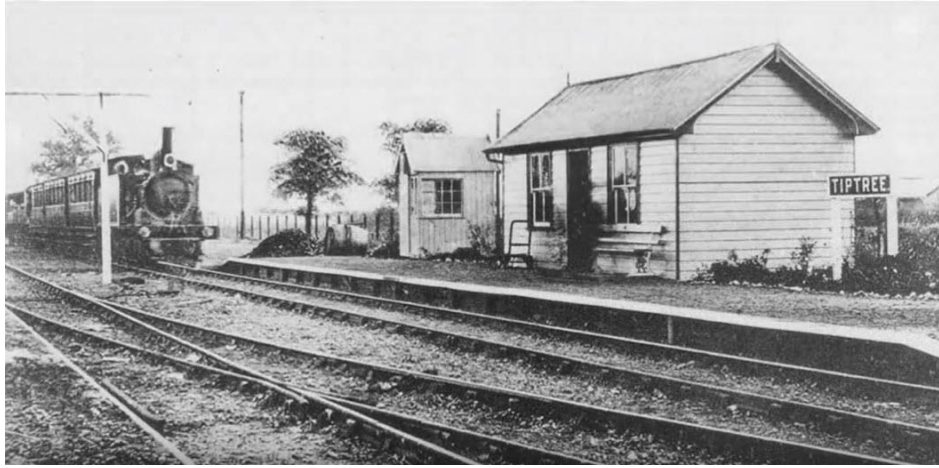
Tollesbury Branch book / Euan Art Productions 2009