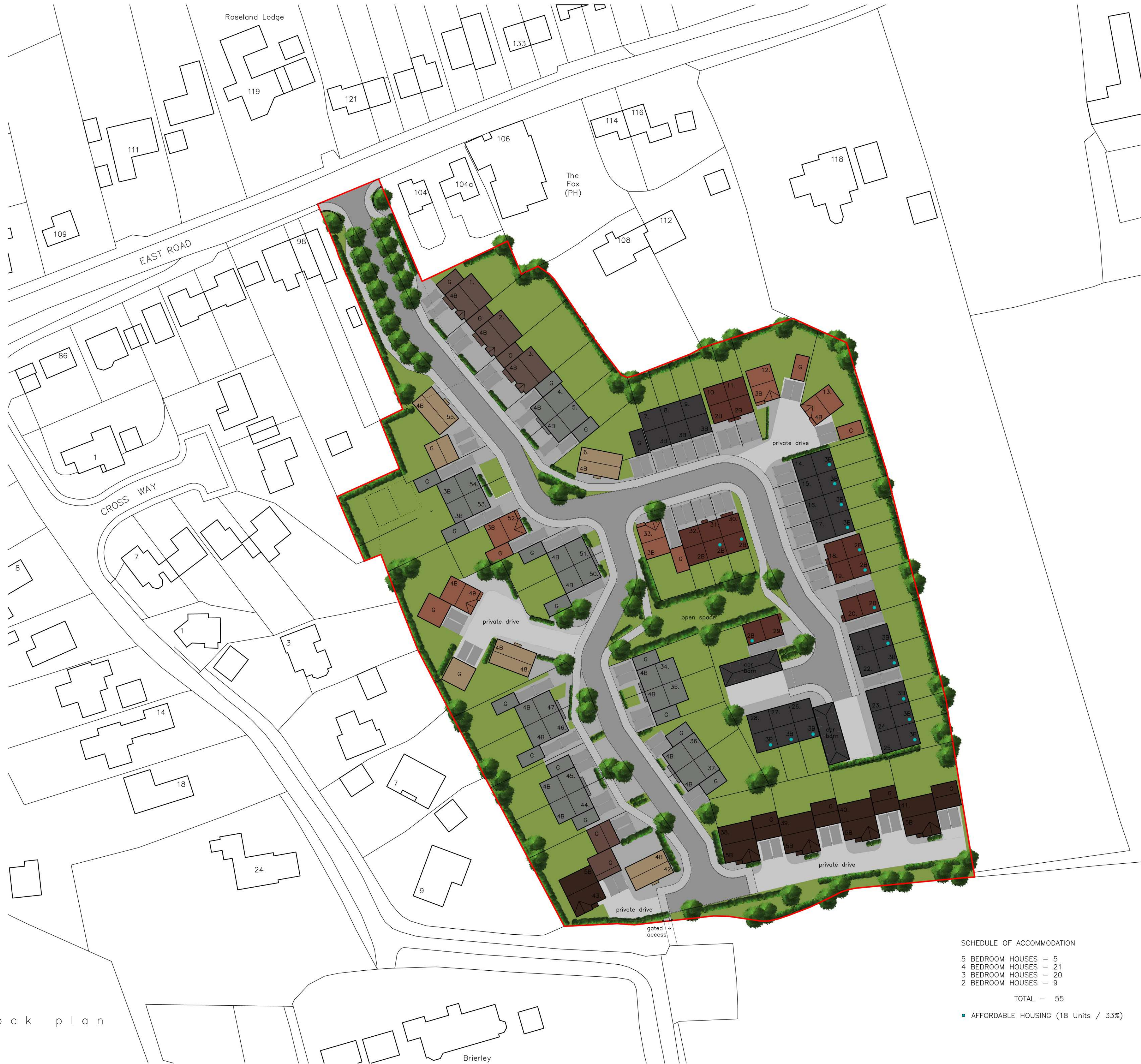
proposed block plan scale 1:500