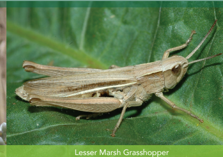
Lesser Marsh Grasshopper