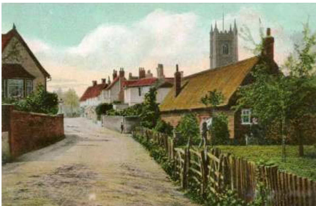
Mill Lane Looking South