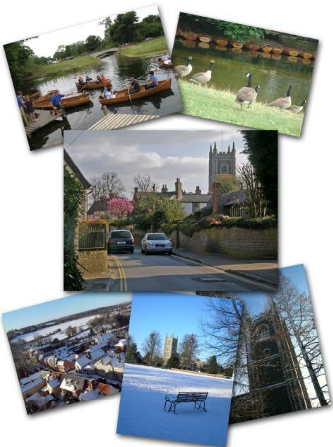
Dedham Photo Competition 2010 Finalists